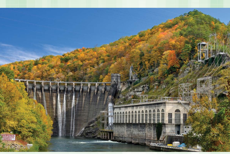
Brookfield Smoky Mountain Project- Cheoah Dam, NC

If you don't have internet access, please mail one copy of your filing to: Secretary, Federal Energy Regulatory Commission, 888 First Street NE, Washington, DC 20426. If filing via hard-copy, every filing of CEII or Privileged material must also contain a public document. In addition, you must send courtesy copies of those items listed on the previous pages to the appropriate office.