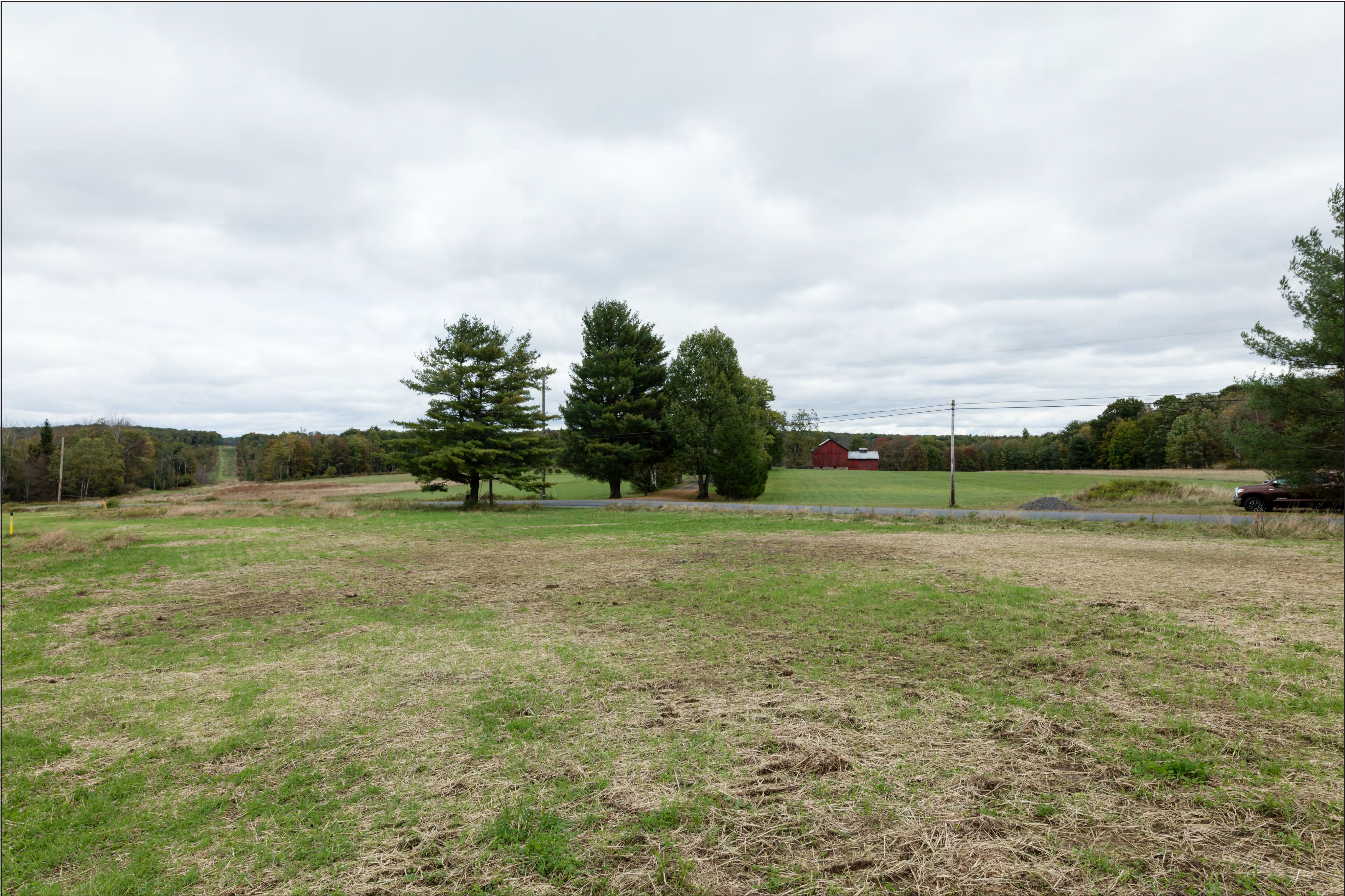
Viewpoint 02 - Bridge Out Road, Looking East - Existing View (Pre-Construction) Artist Impression Subject to Change