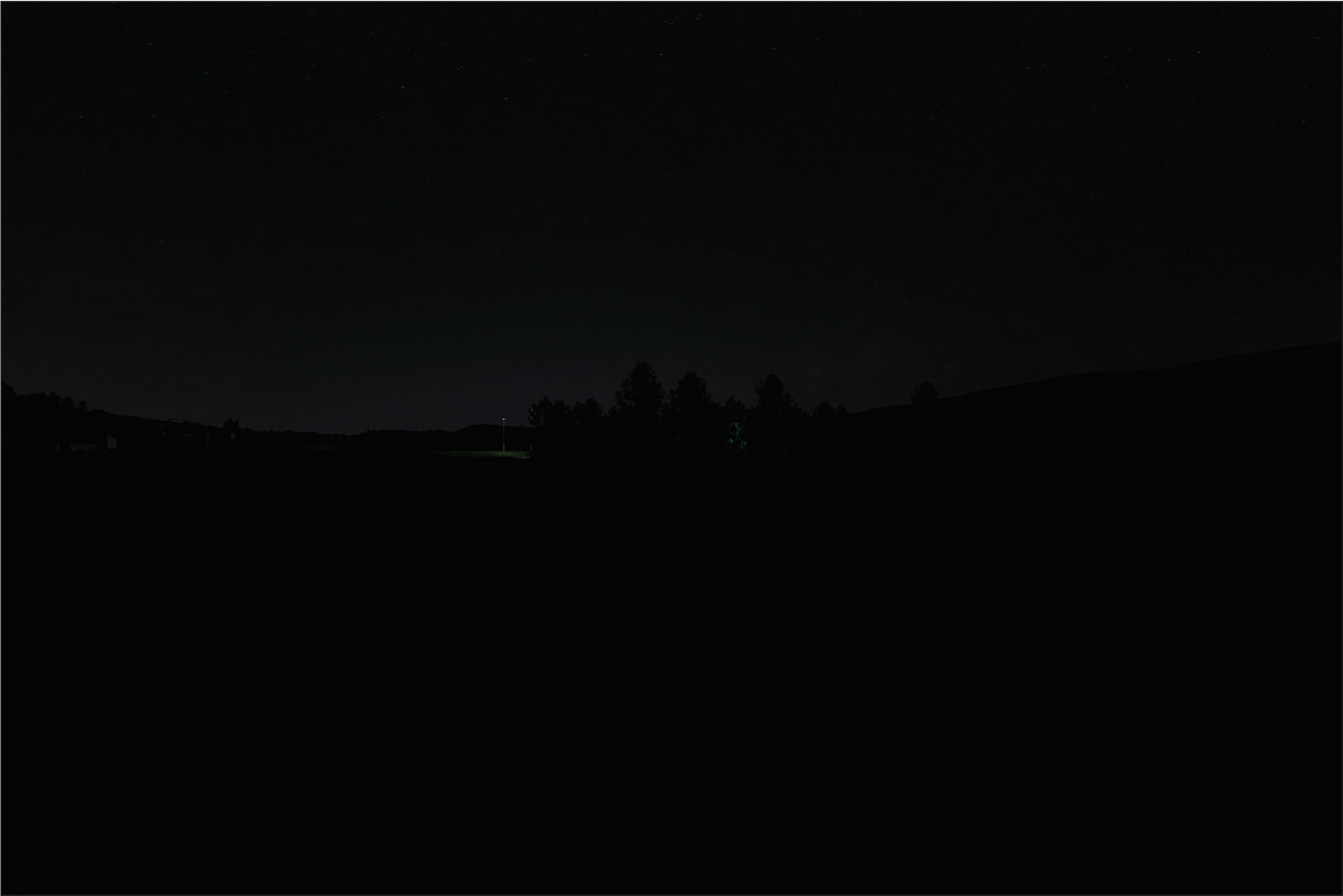
Viewpoint 10 - Bridge Road (Looking East) - Simulated Proposed Post-Construction View - Visual Screening including Vegetation - 14-17 feet - Night Artist Impression Subject to Change