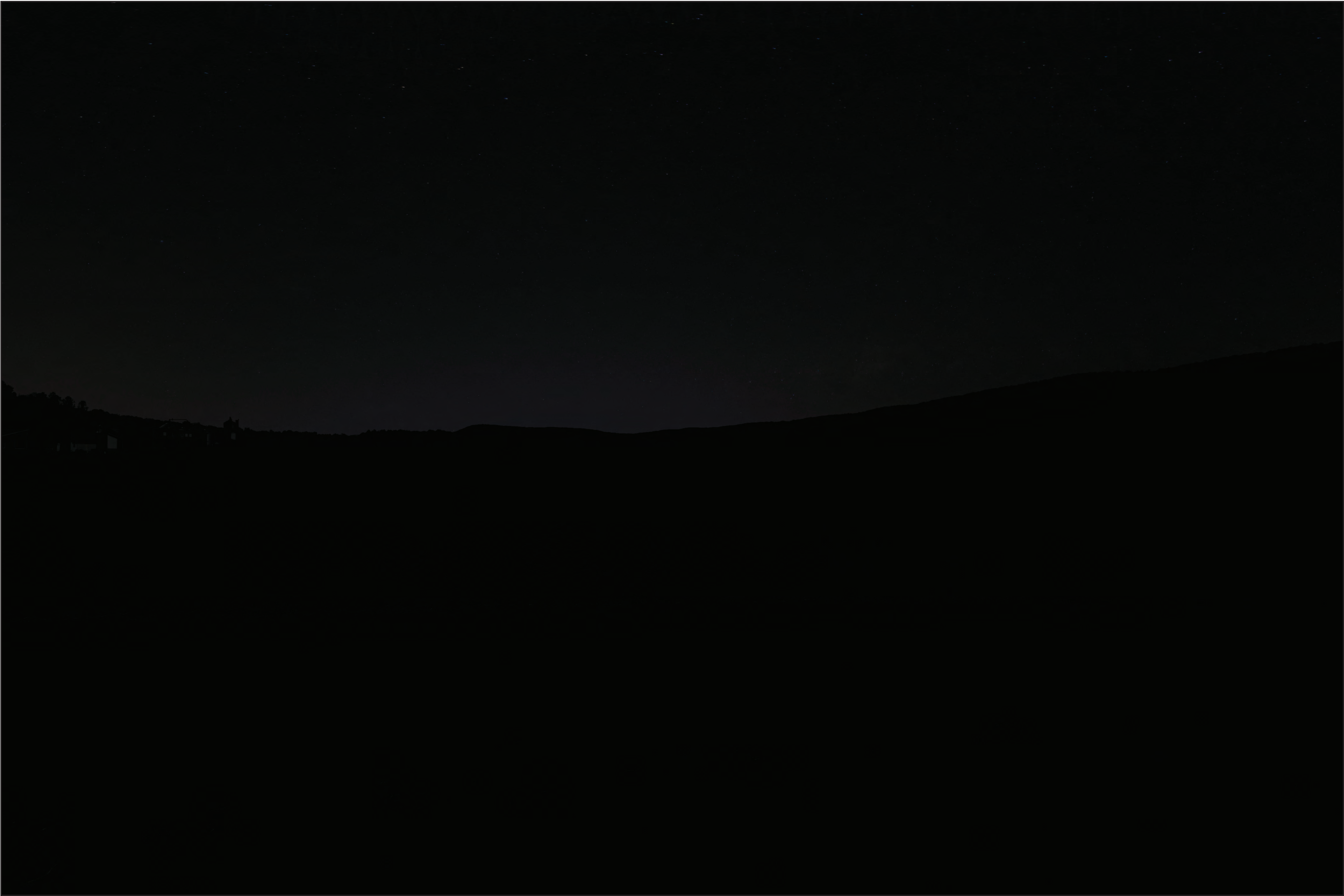
Viewpoint 10 - Bridge Road (Looking East) - Existing View (Pre-Construction) - Night Artist Impression Subject to Change