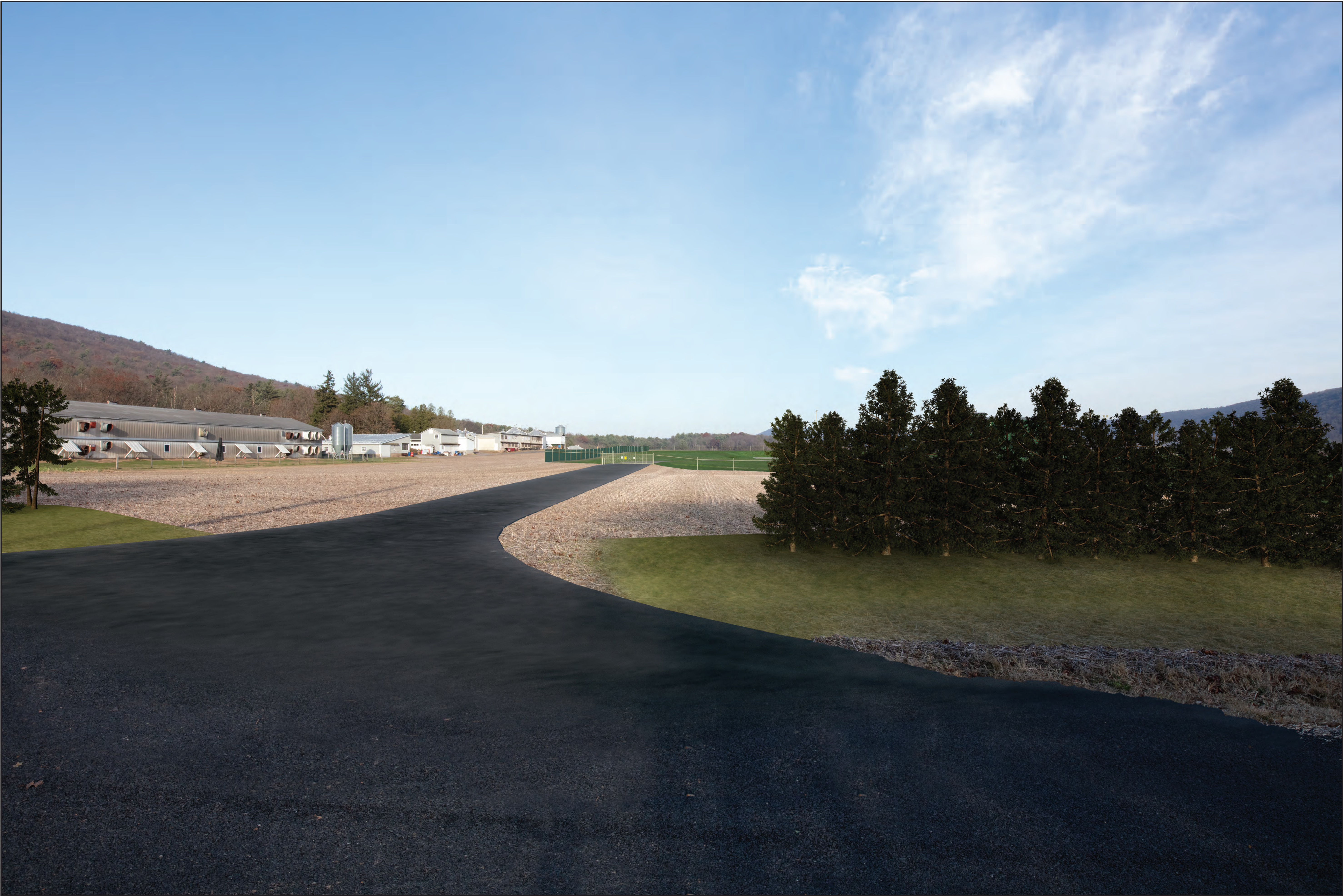
Viewpoint 10 - Bridge Road (Looking East) - Simulated Proposed Post-Construction View - Visual Screening including Vegetation - 14-17 feet Artist Impression Subject to Change