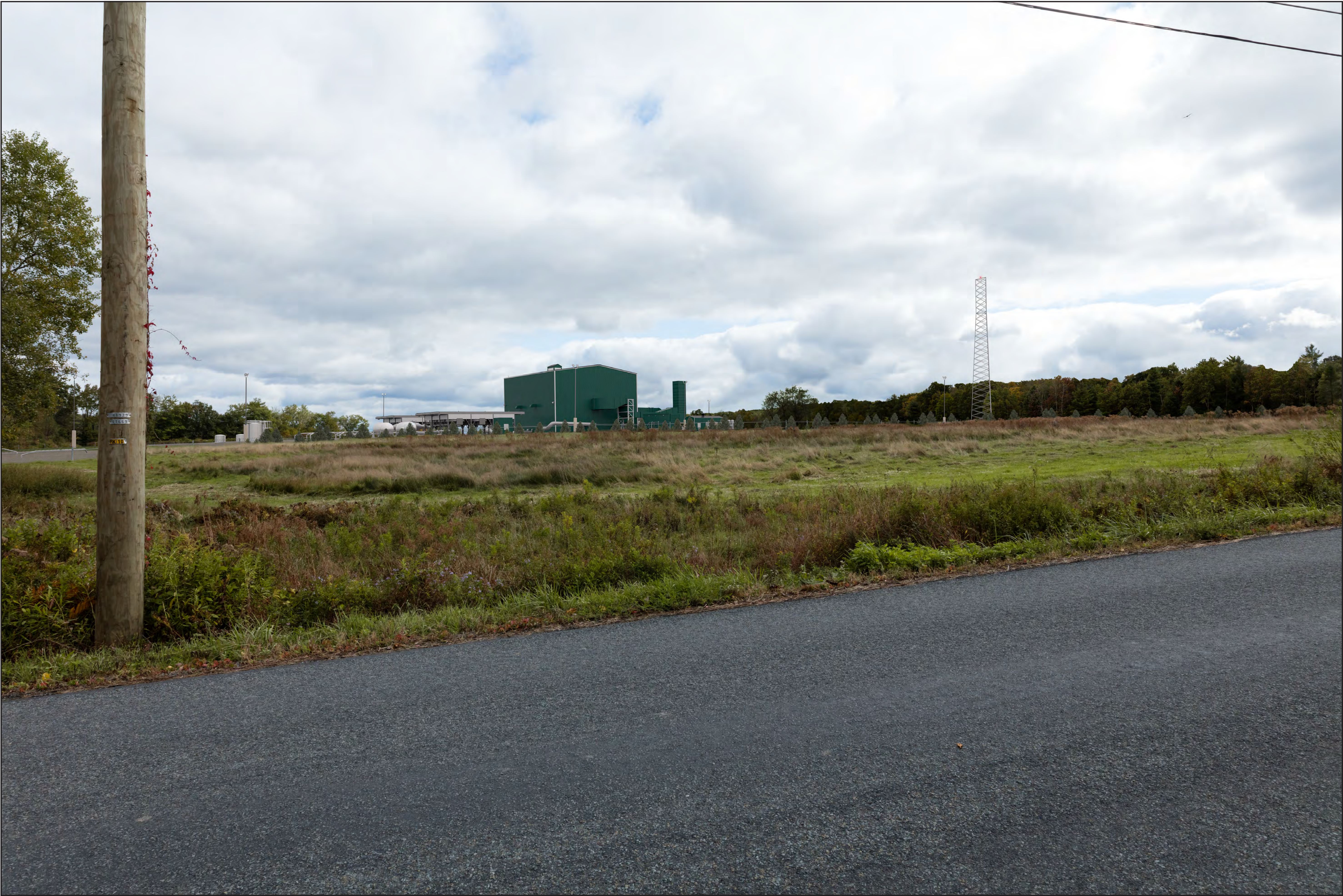
Viewpoint 01 - Maransky Road, Looking South East - Simulated Post-Construction View - Visual Screening - 4-9 feet Artist Impression Subject to Change