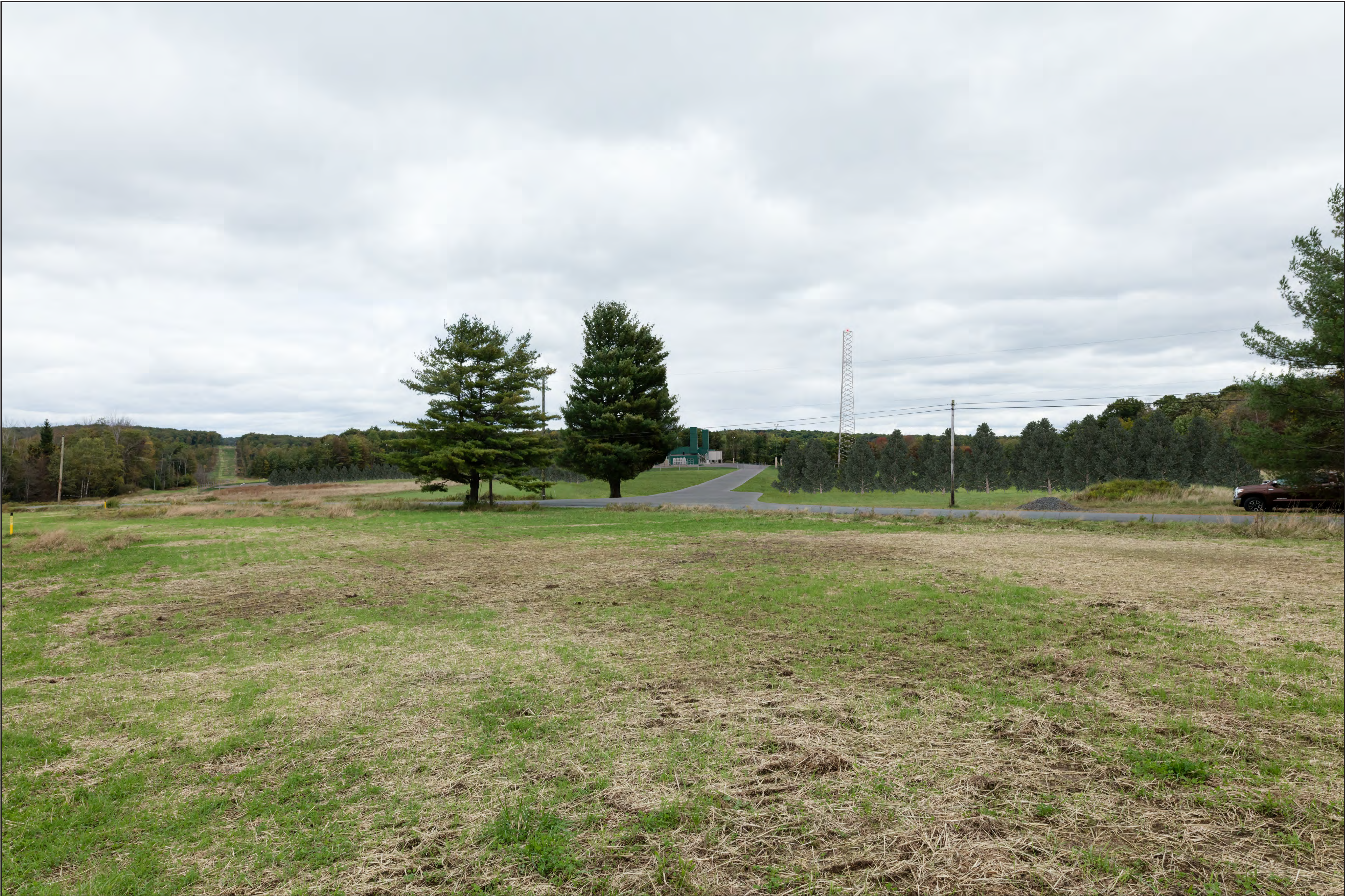
Viewpoint 02 - Bridge Out Road, Looking East - Simulated Post-Construction View - Visual Screening - 14-17 feet Artist Impression Subject to Change