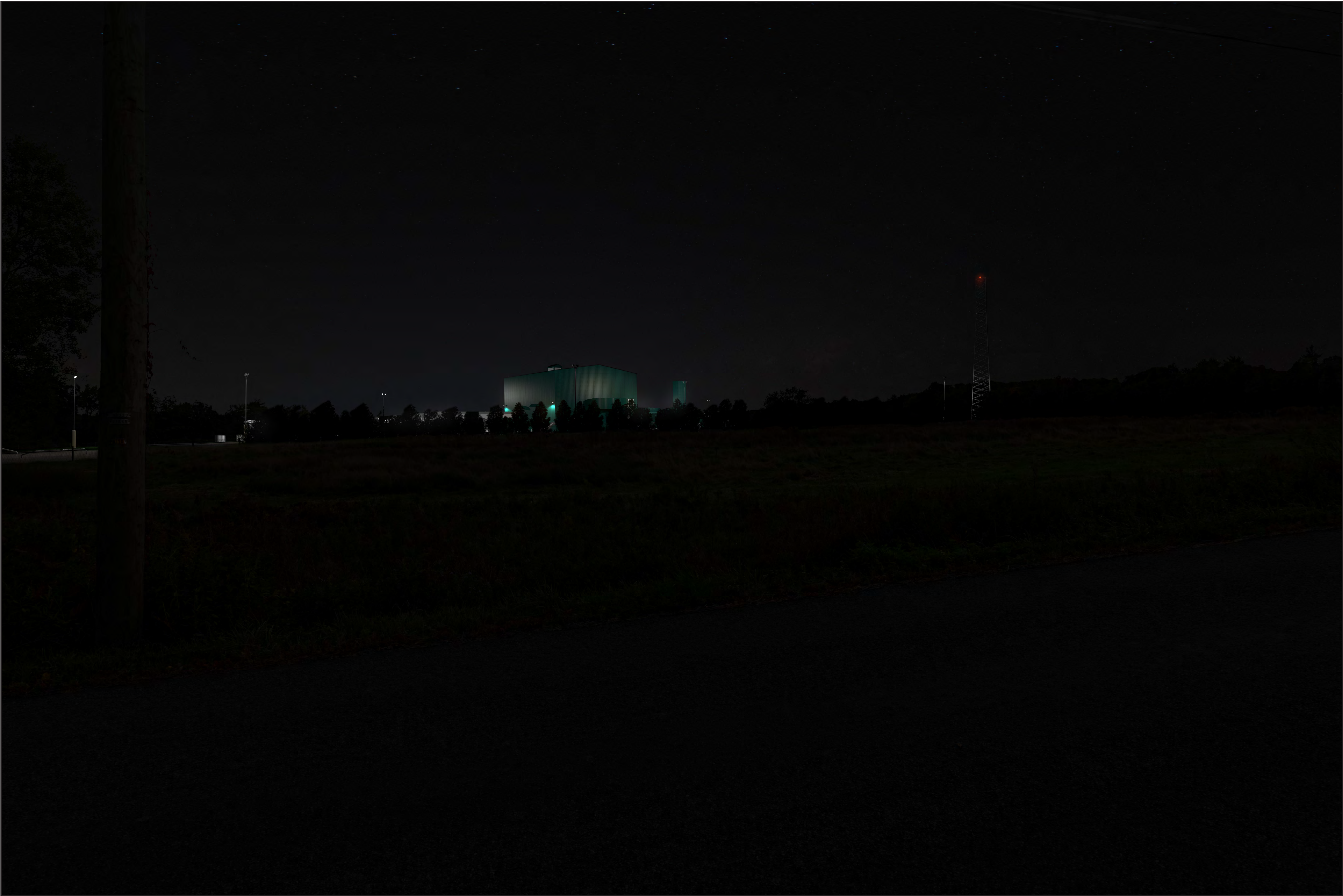
Viewpoint 01 - Maransky Road, Looking South East - Simulated Post-Construction View - Visual Screening - 14-17 feet - Night Artist Impression Subject to Change