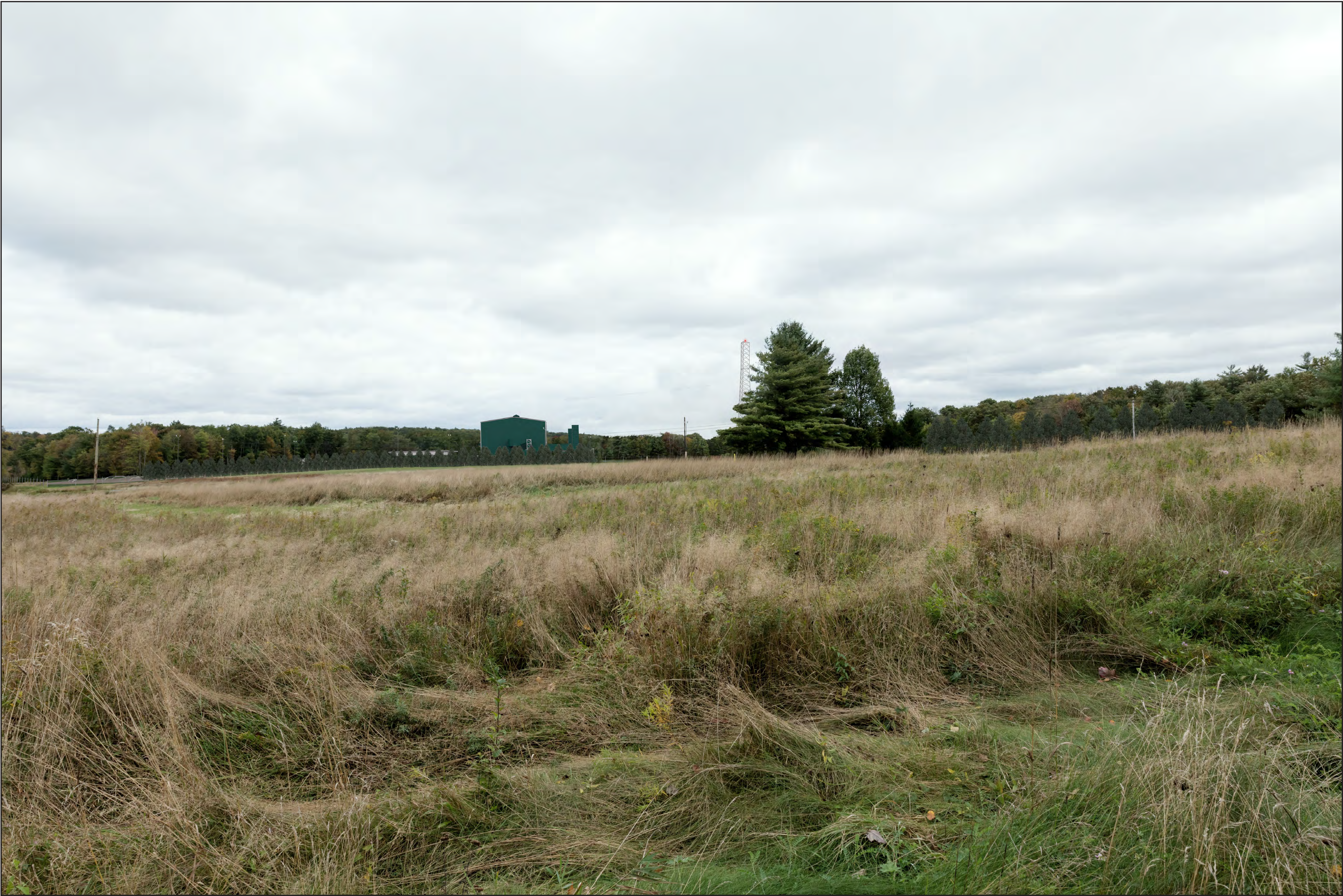
Viewpoint 03 - Bridge Out Road, East - Simulated Post-Construction View - Visual Screening - 14-17 feet Artist Impression Subject to Change