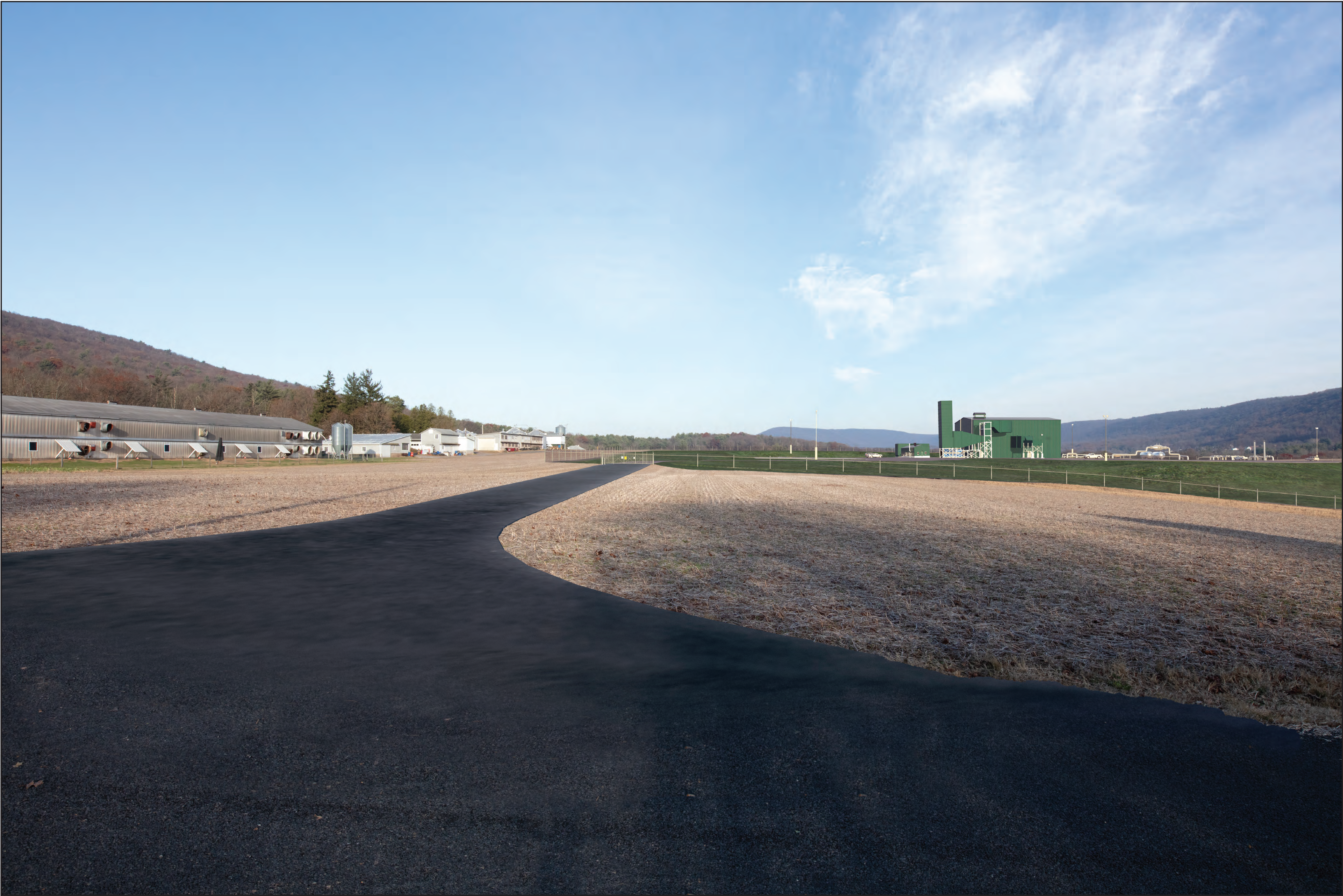
Viewpoint 10 - Bridge Road (Looking East) - Simulated Proposed Post-Construction View