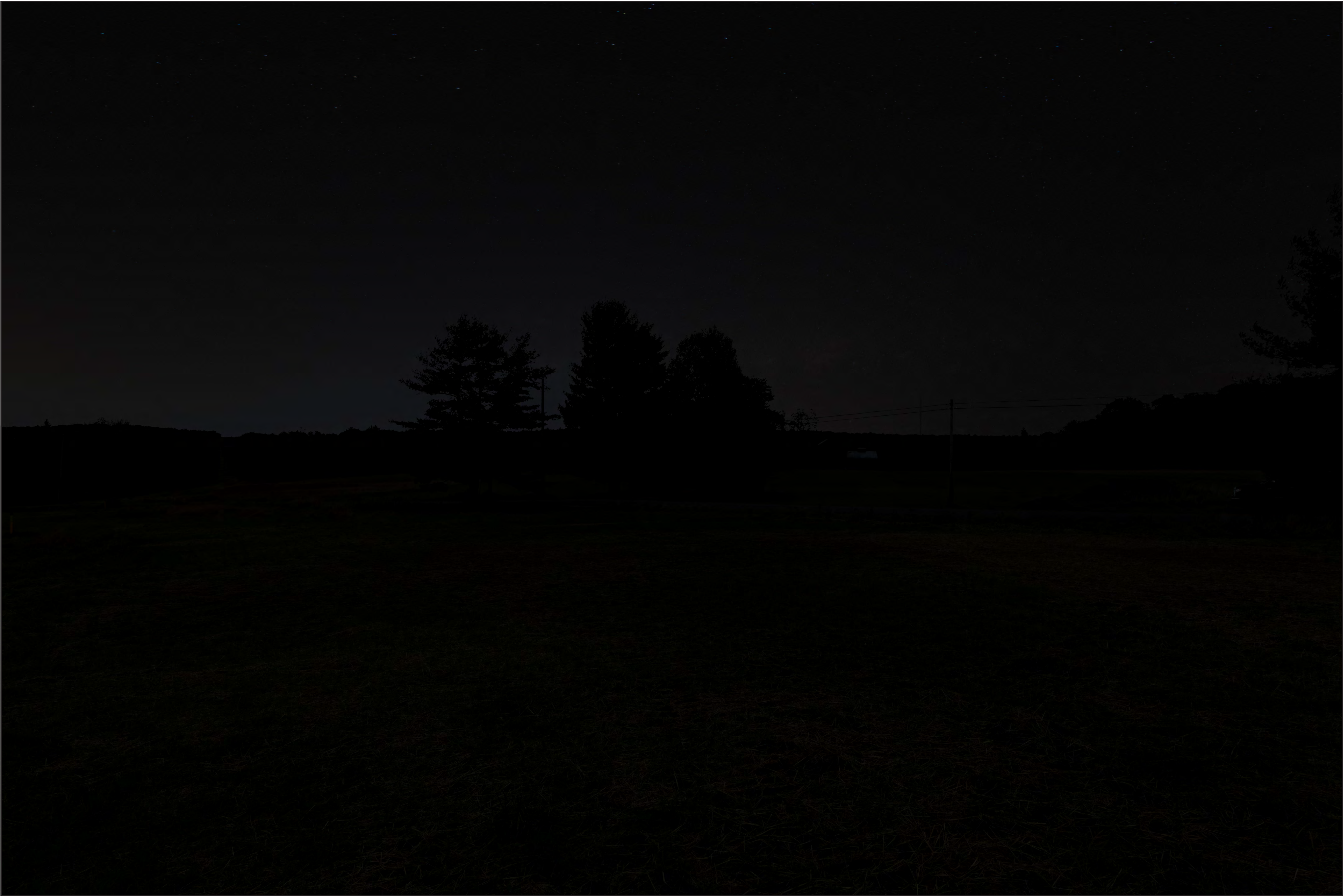
Viewpoint 02 - Bridge Out Road, Looking East - Existing View (Pre-Construction) - Night Artist Impression Subject to Change