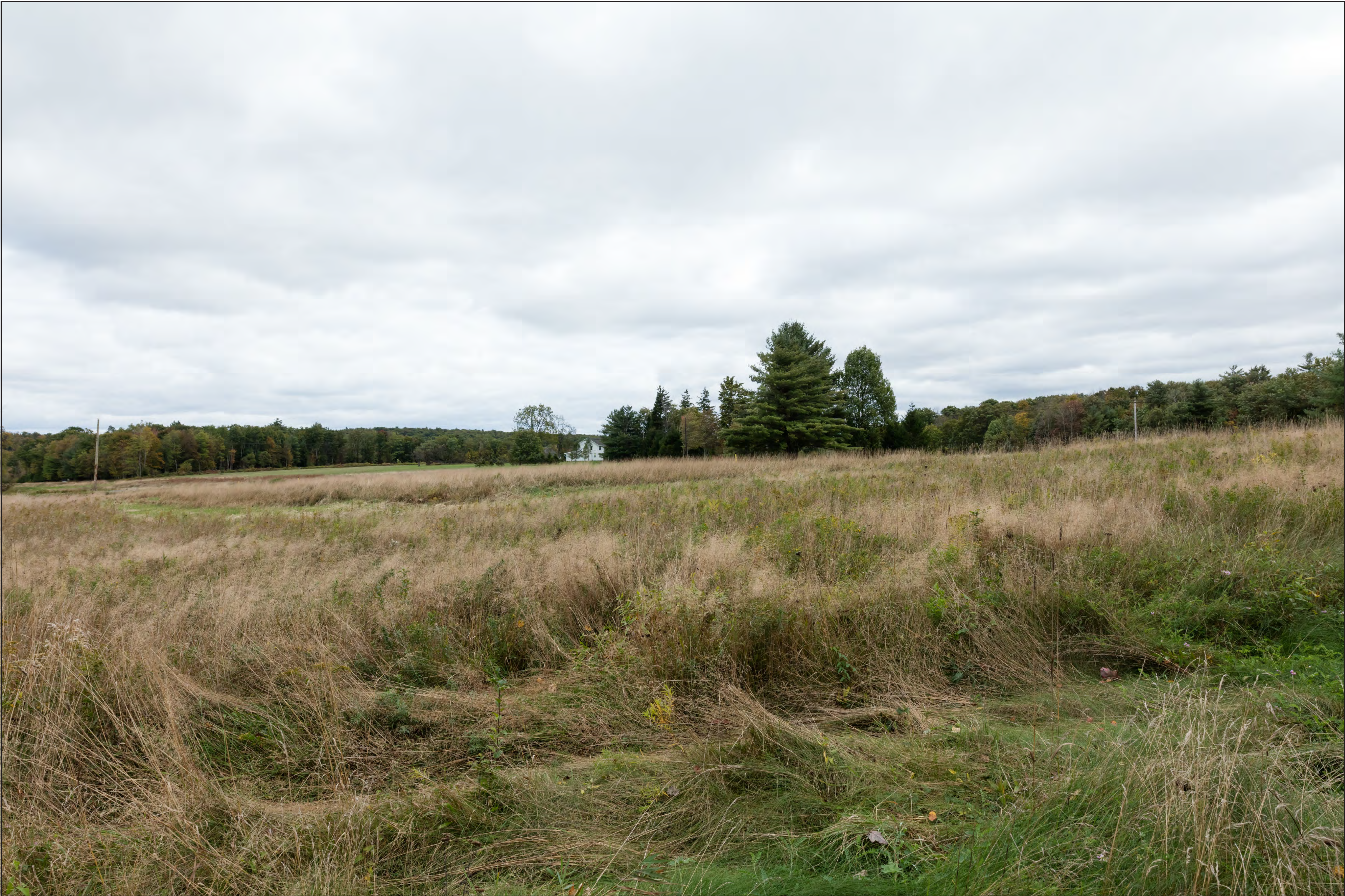
Viewpoint 03 - Bridge Out Road, East - Existing View (Pre-Construction) Artist Impression Subject to Change