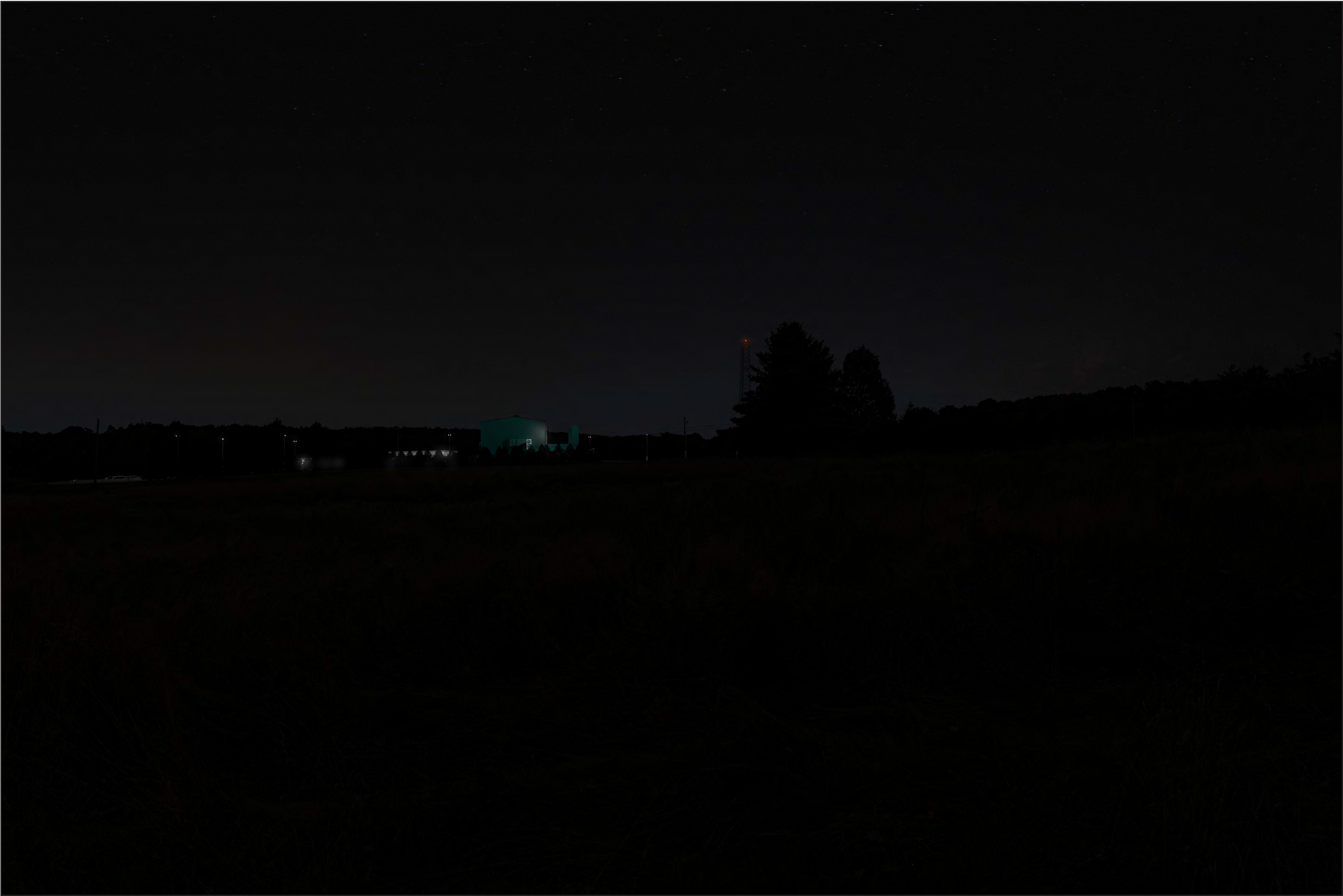
Viewpoint 03 - Bridge Out Road, East - Simulated Post-Construction View - Visual Screening - 14-17 feet - Night Artist Impression Subject to Change