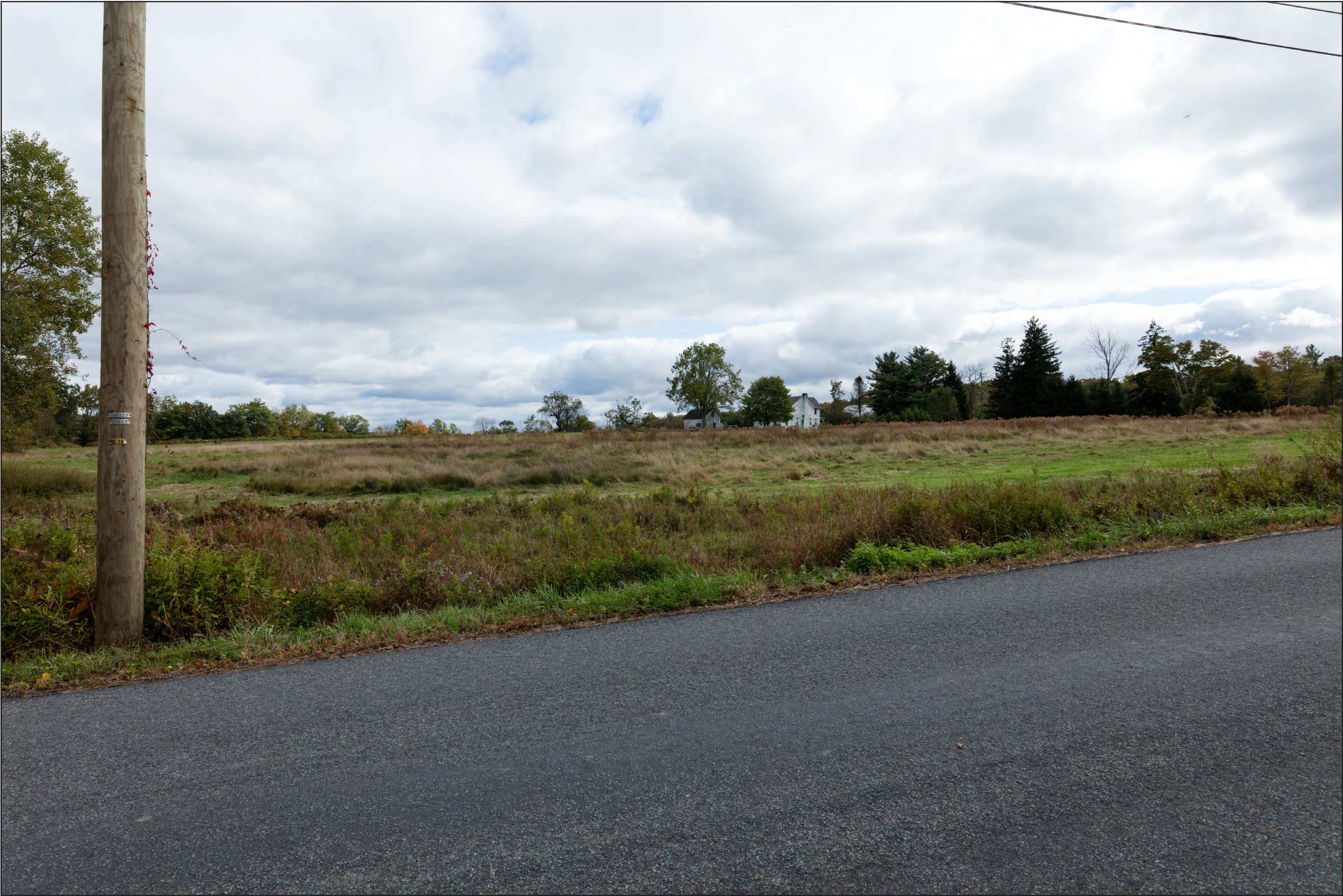
Viewpoint 01 - Maransky Road, Looking South East - Existing View (Pre-Construction)