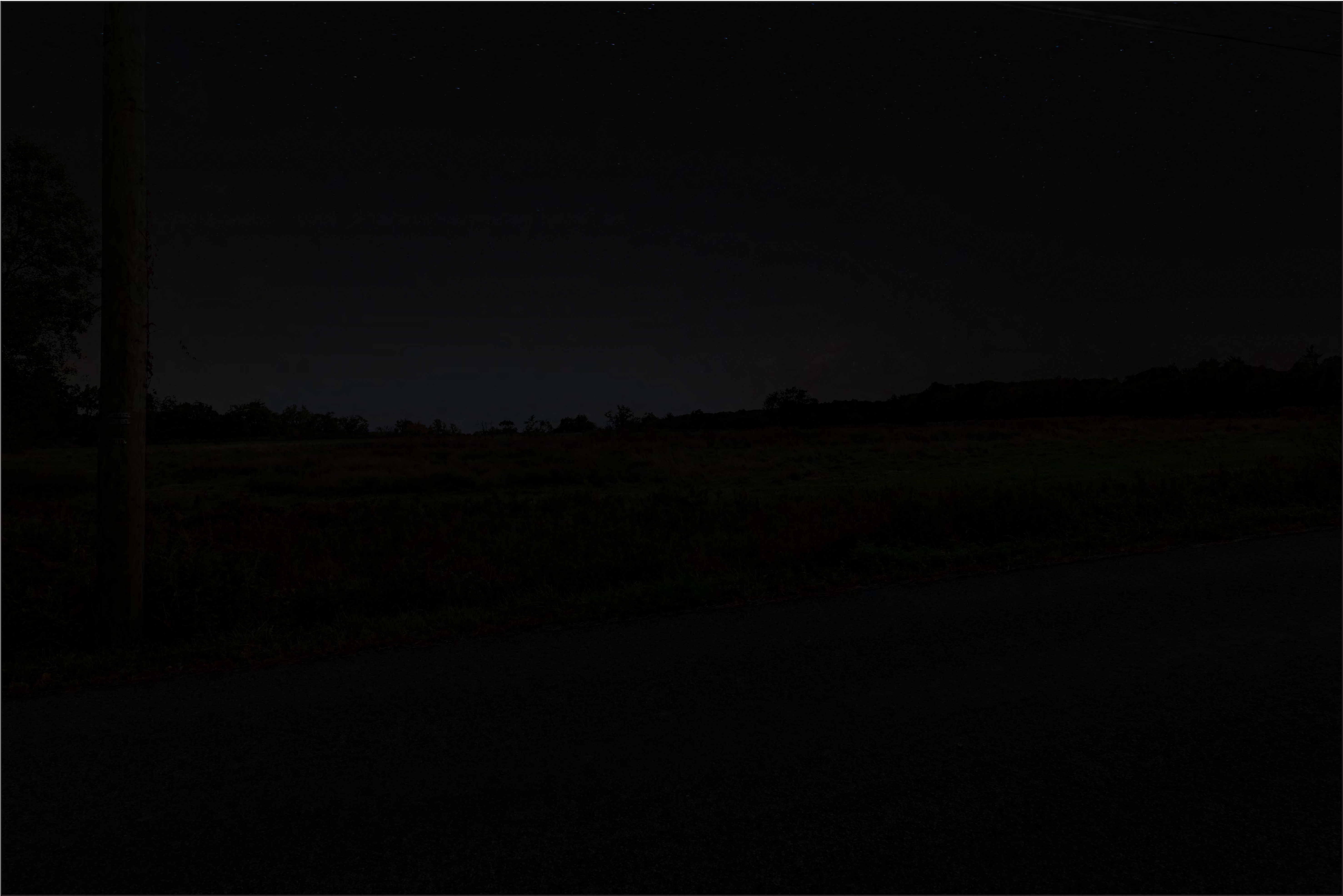
Viewpoint 01 - Maransky Road, Looking South East - Existing View (Pre-Construction) - Night Artist Impression Subject to Change