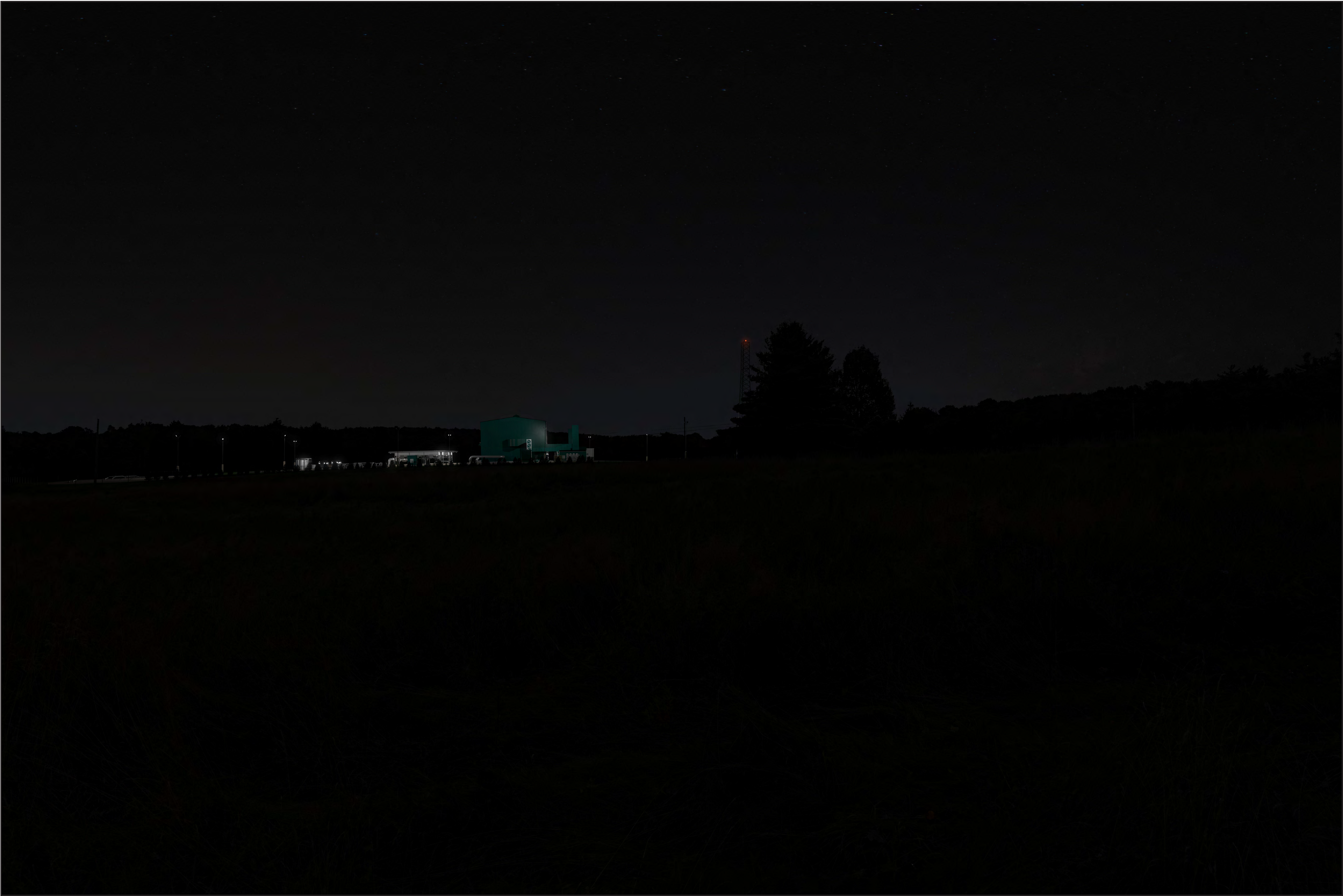
Viewpoint 03 - Bridge Out Road, East - Simulated Post-Construction View - Visual Screening - 4-9 feet - Night Artist Impression Subject to Change