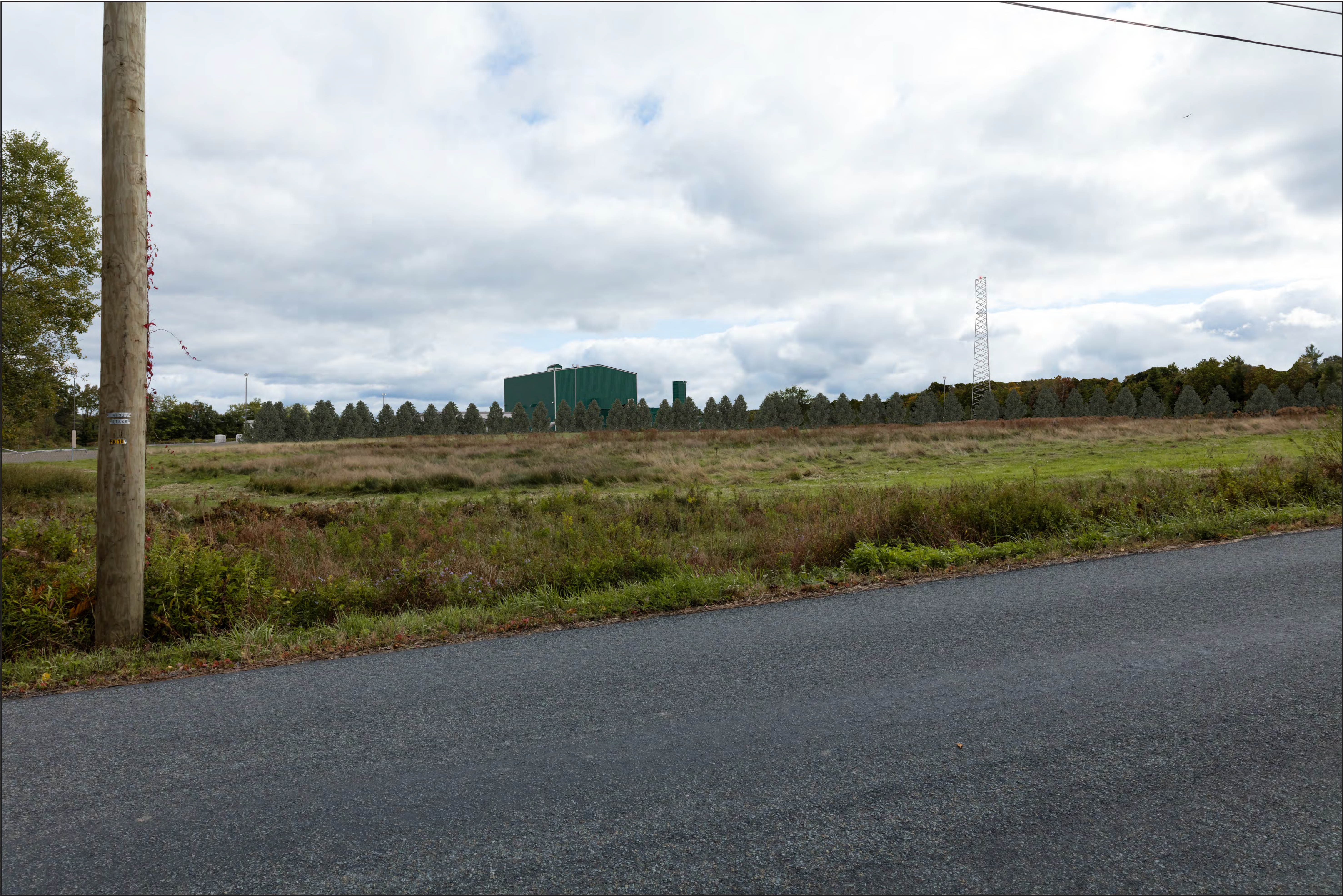
Viewpoint 01 - Maransky Road, Looking South East - Simulated Post-Construction View - Visual Screening - 14-17 feet Artist Impression Subject to Change