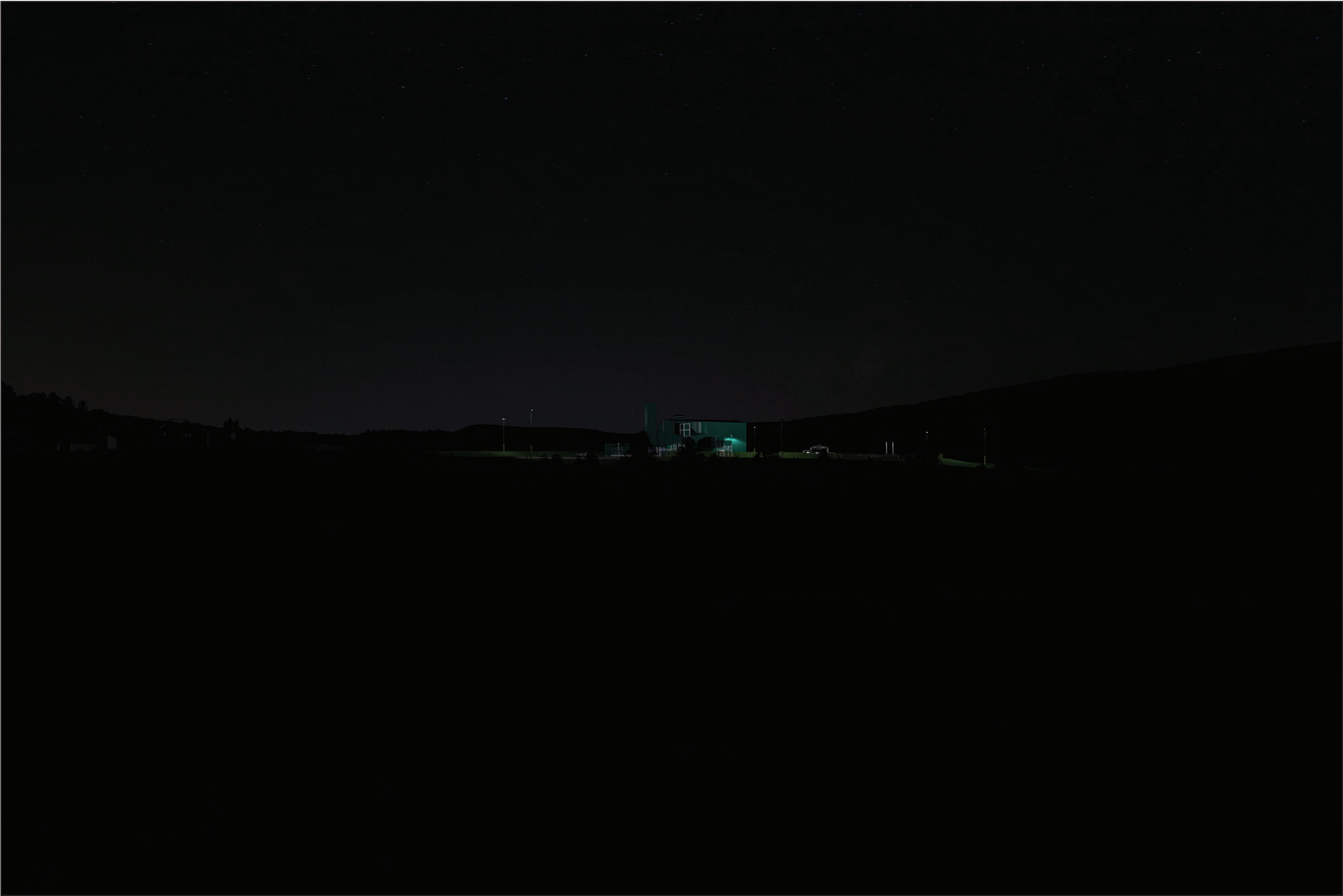
Viewpoint 10 - Bridge Road (Looking East) - Simulated Proposed Post-Construction View - Visual Screening including Vegetation - 4-9 feet - Night Artist Impression Subject to Change