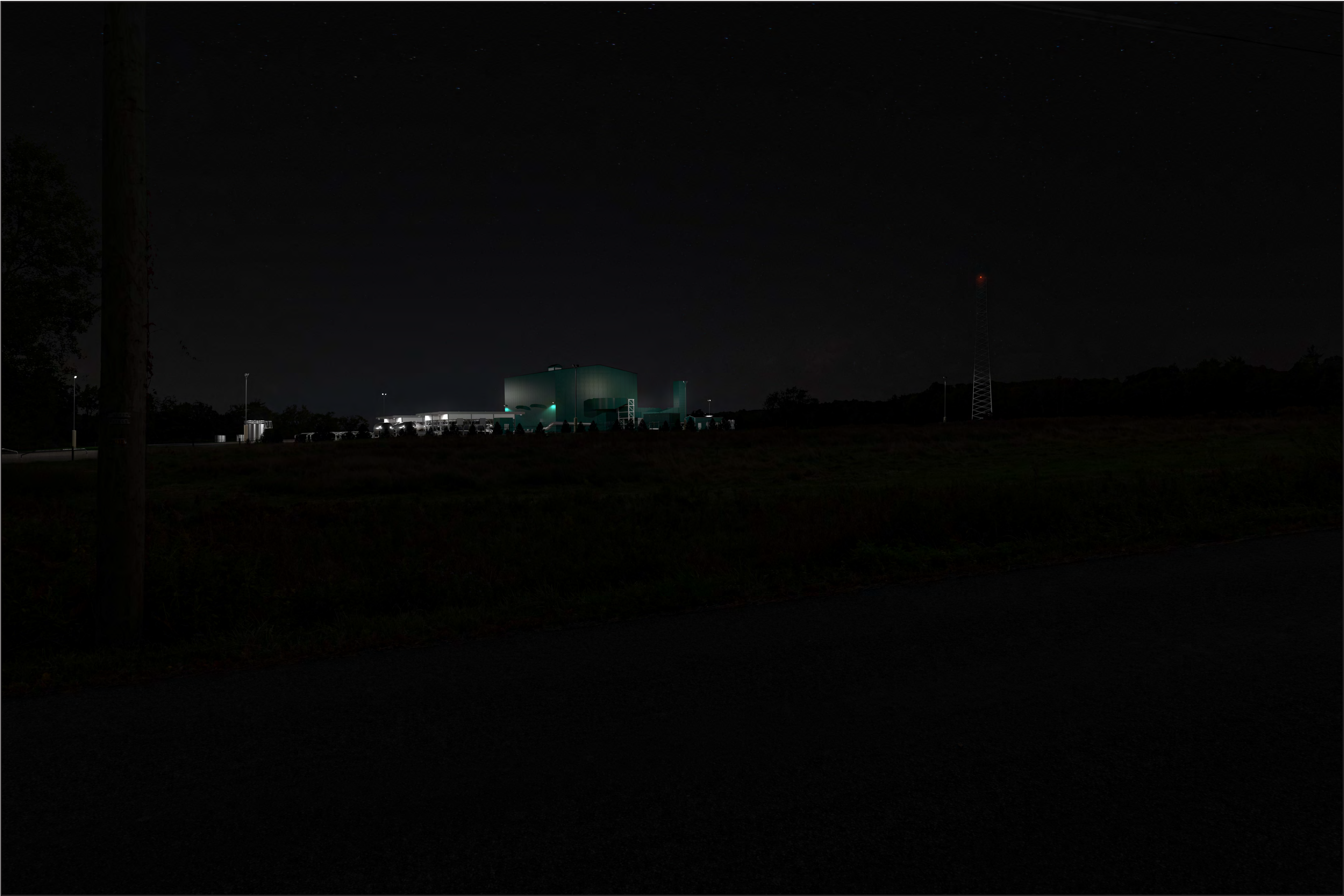
Viewpoint 01 - Maransky Road, Looking South East - Simulated Post-Construction View - Visual Screening - 4-9 feet - Night