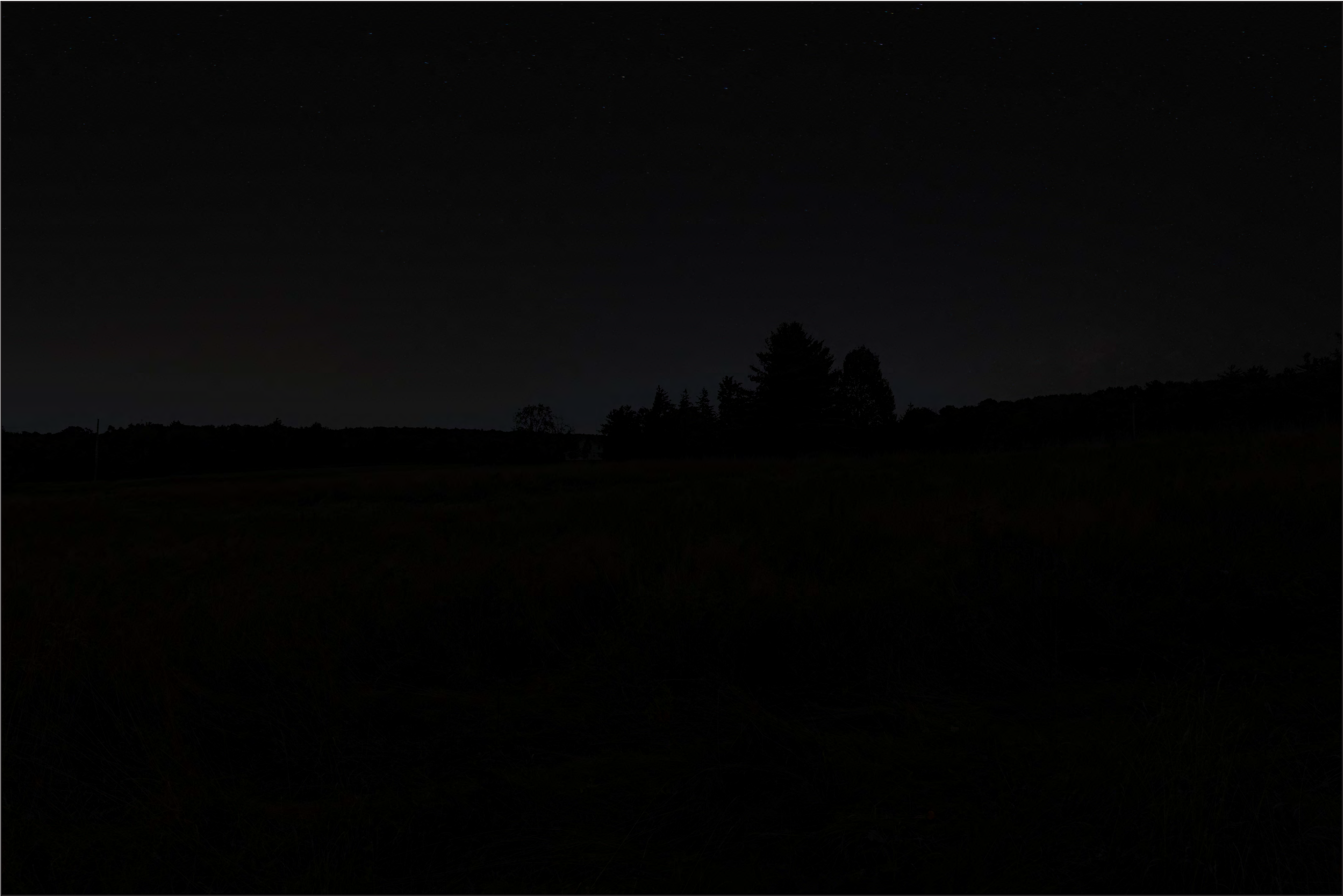
Viewpoint 03 - Bridge Out Road, East - Existing View (Pre-Construction) - Night Artist Impression Subject to Change