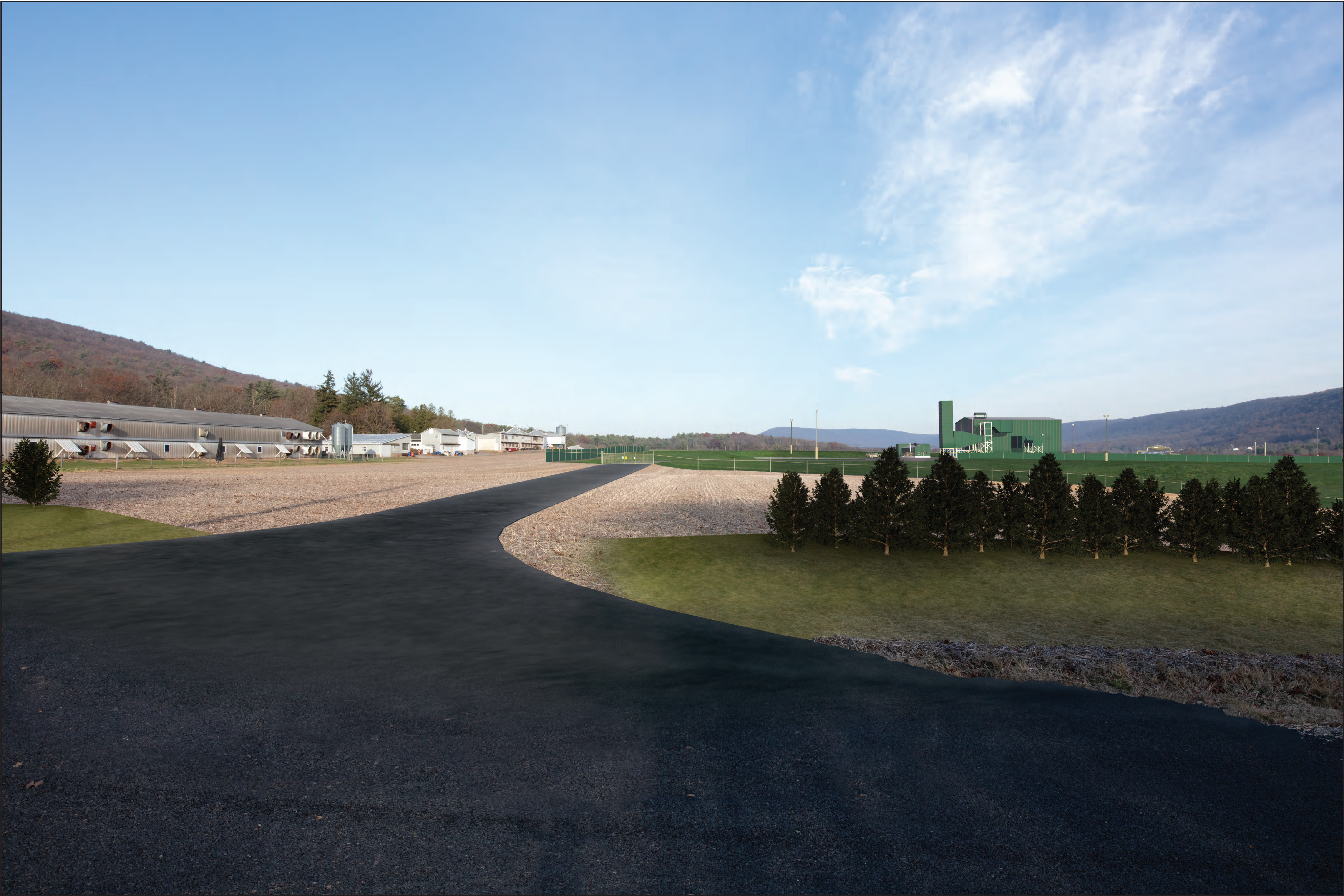
Viewpoint 10 - Bridge Road (Looking East) - Simulated Proposed Post-Construction View - Visual Screening including Vegetation - 4-9 feet Artist Impression Subject to Change