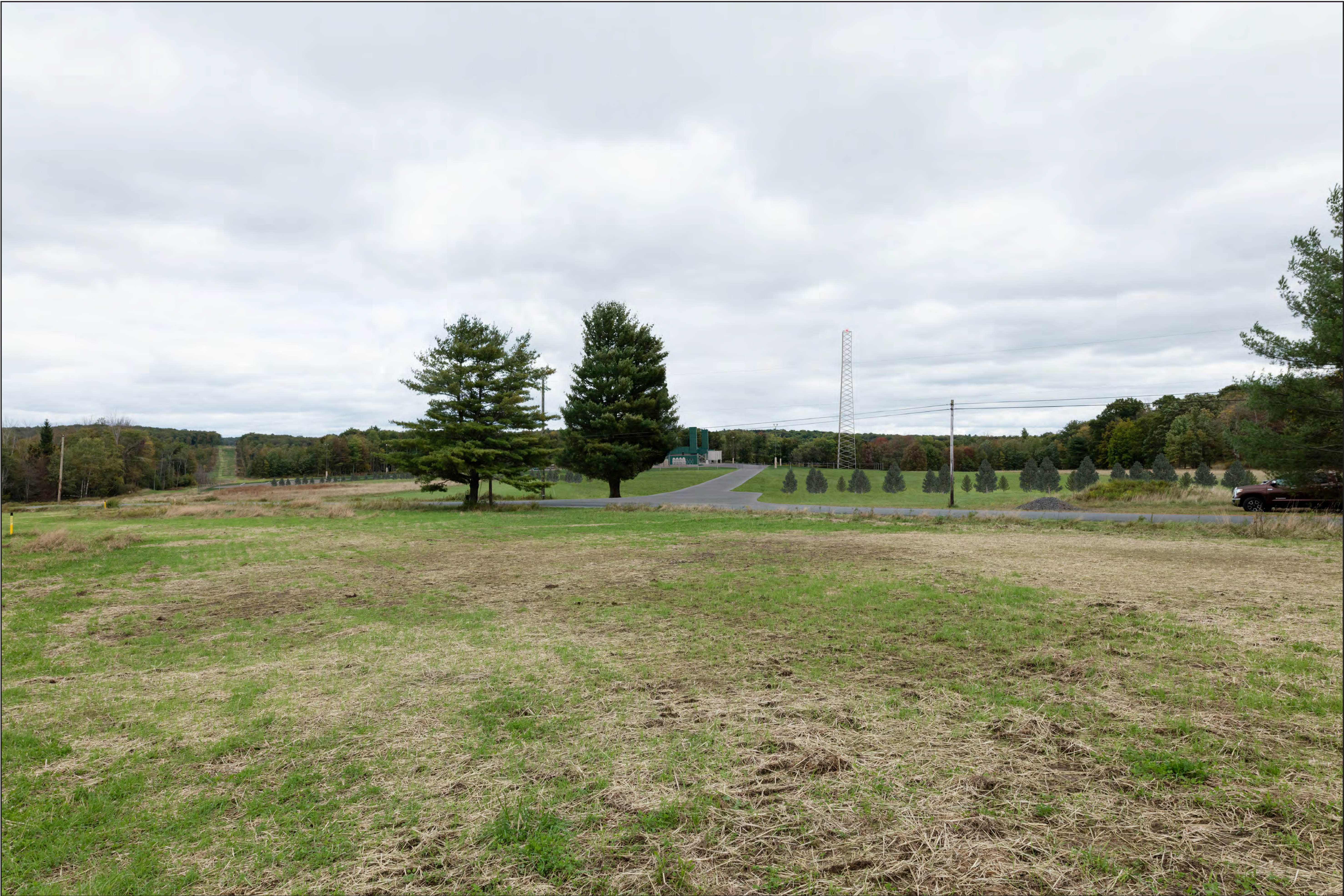
Viewpoint 02 - Bridge Out Road, Looking East - Simulated Post-Construction View - Visual Screening - 4-9 feet Artist Impression Subject to Change