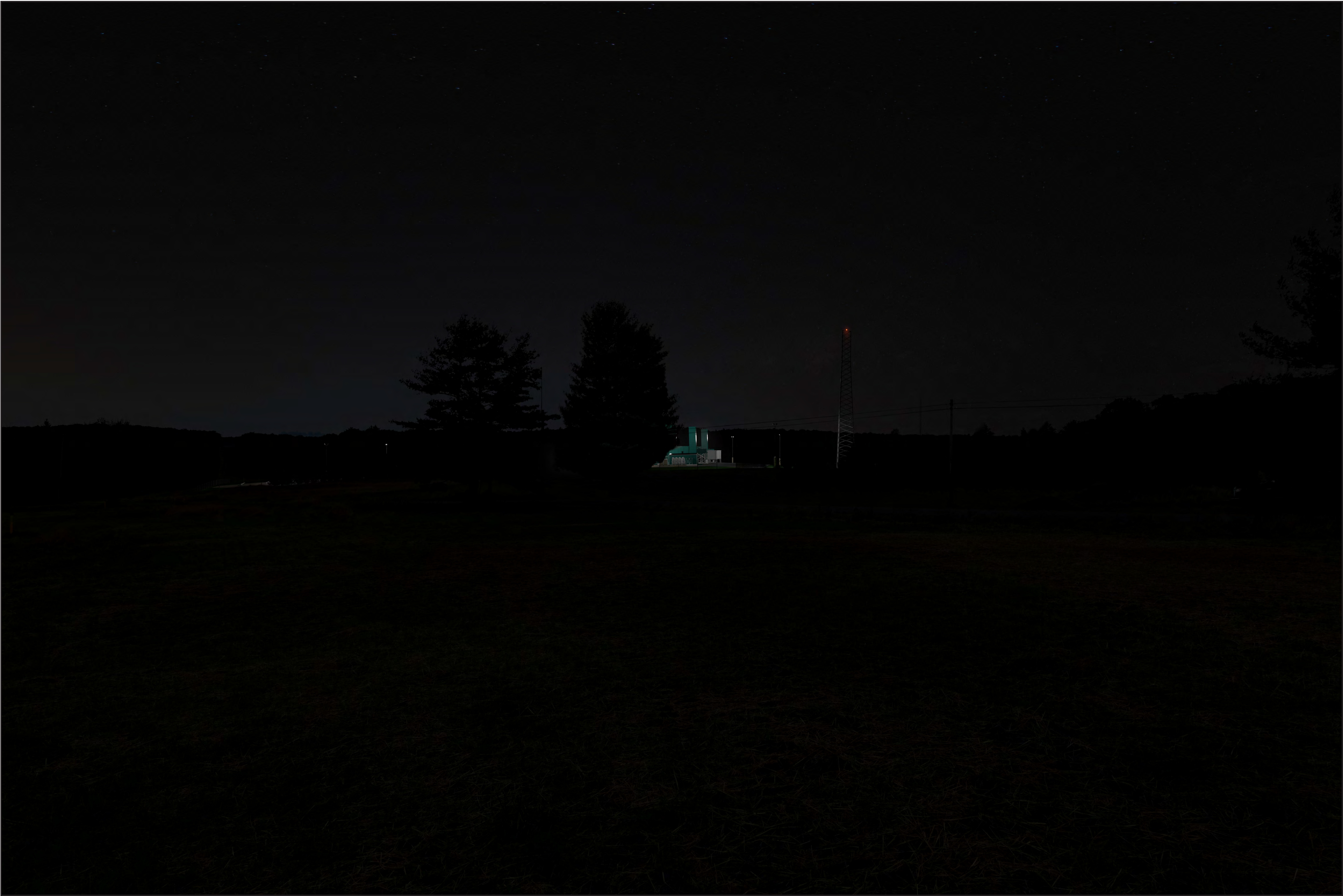
Viewpoint 02 - Bridge Out Road, Looking East - Simulated Post-Construction View - Visual Screening - 14-17 feet - Night Artist Impression Subject to Change