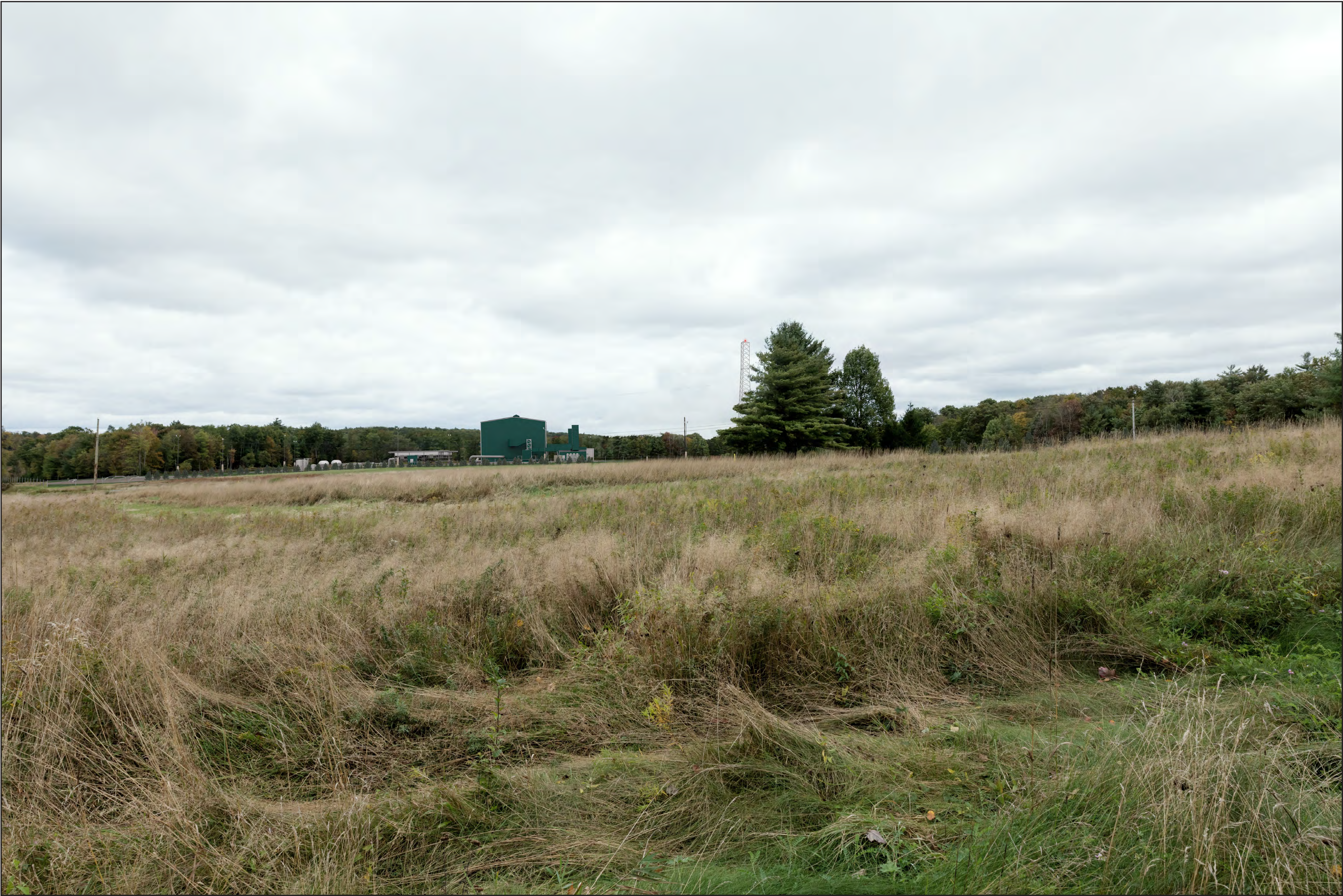
Viewpoint 03 - Bridge Out Road, East - Simulated Post-Construction View - Visual Screening - 4-9 feet Artist Impression Subject to Change