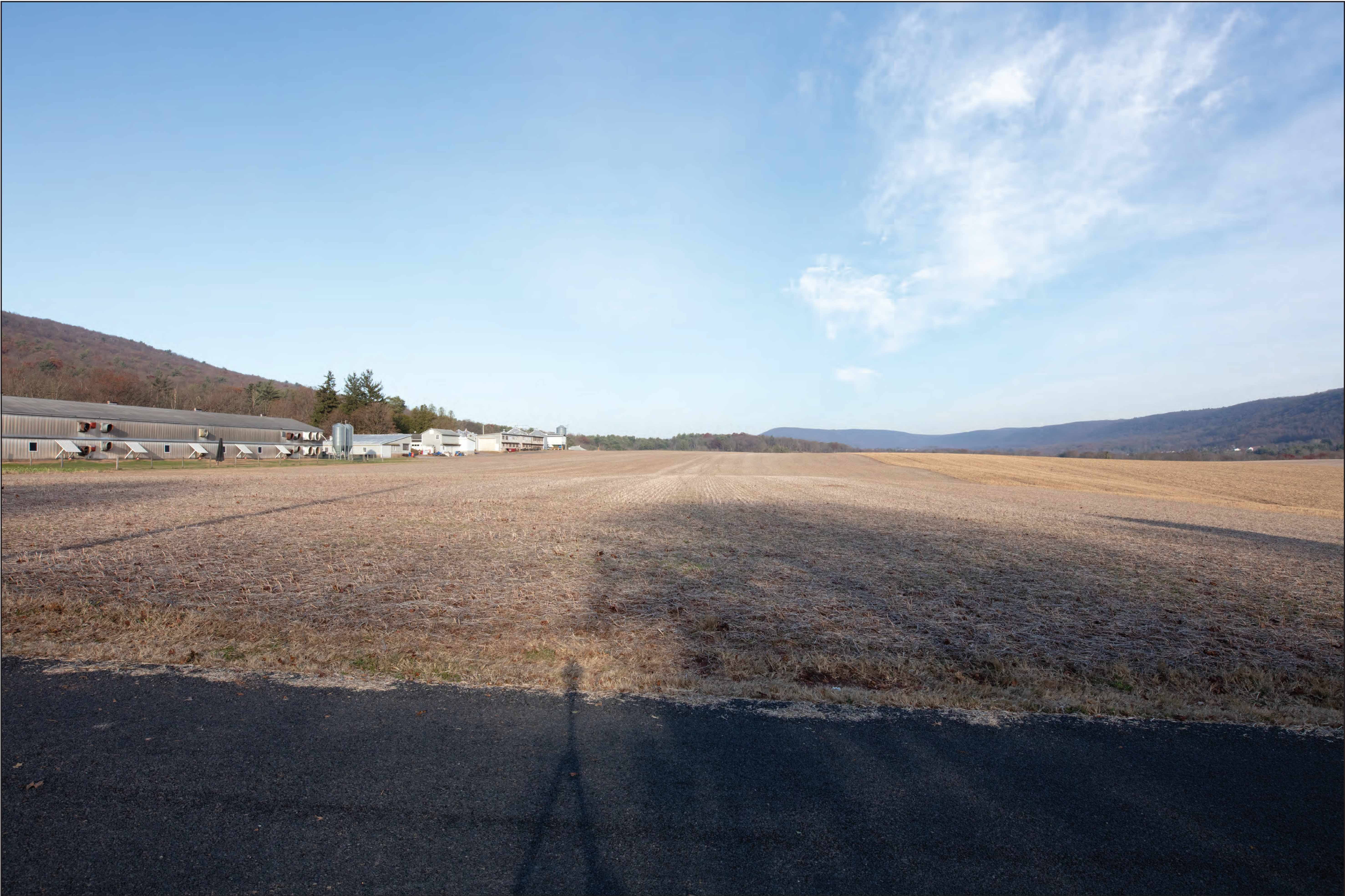
Viewpoint 10 - Bridge Road (Looking East) - Existing View (Pre-Construction) Artist Impression Subject to Change