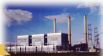
Laramie River Station