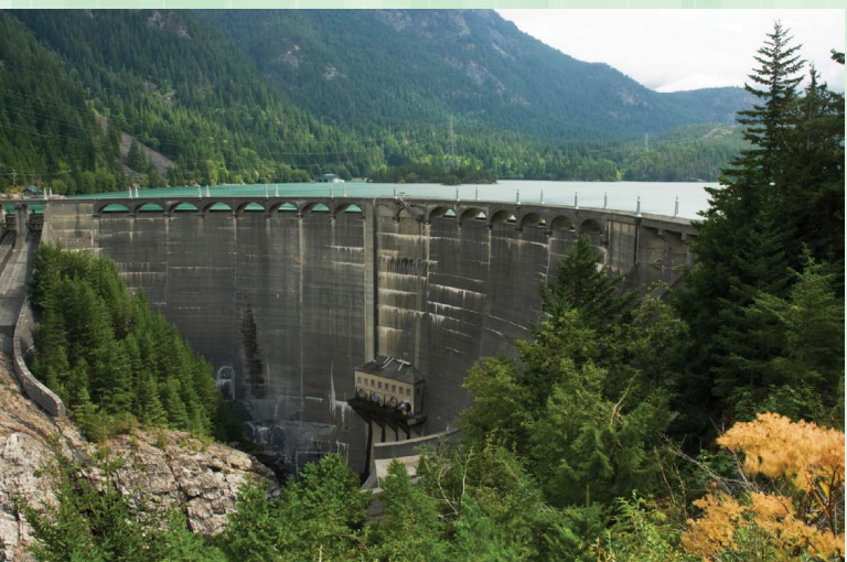
Skagit River Project- Diablo Dam, WA

Specific instructions for filing exhibit drawings and GIS data are included in Commission Orders that require the filing of this information. Additional information can be found here: https://www.ferc.gov/sites/default/files/2020-04/drawings-guide.pdf .