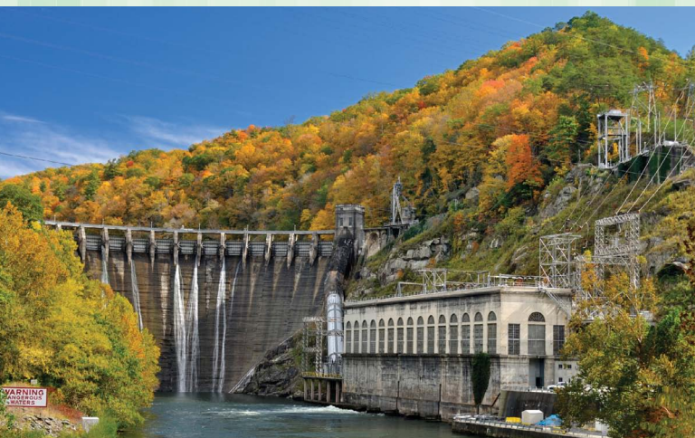
Brookfield Smoky Mountain Project- Cheoah Dam, NC

If you don't have internet access, please mail one copy of your filing to: Secretary, Federal Energy Regulatory Commission, 888 First Street NE, Washington, DC 20426. If filing via hard-copy, every filing of CEI or Privileged material must also contain a public document. In addition, you must send courtesy copies of those items listed on the previous pages to the appropriate office.