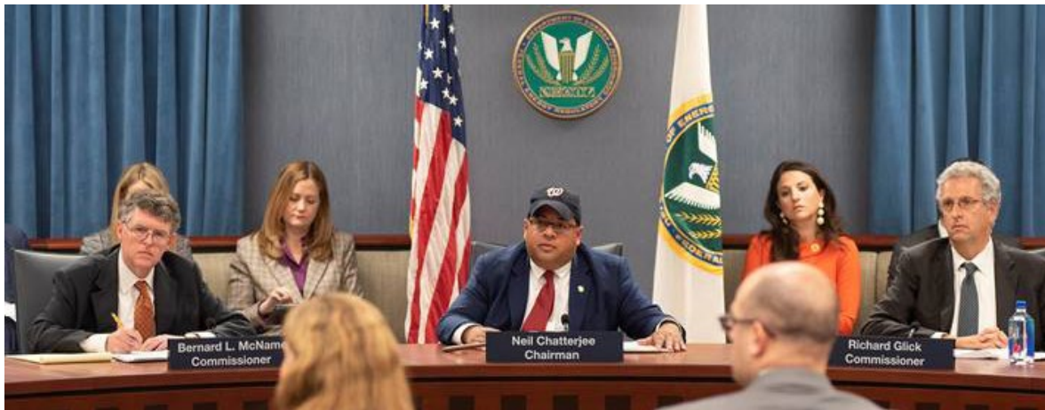
Chairman and Commissioners at the October 2019 meeting.

Delegated Orders & Notices | Notational Orders