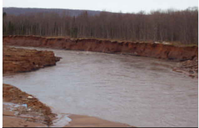
Photo 6. Erosion below Silver Lake.

turbidity is an increase in downstream drift. Aquatic insects will dislodge from the substrate in response to decreased light. Prolonged levels of turbidity will result in the depletion of benthic macroinvertebrates and severe damage can result from heavy sediment deposits. (Photo 6).