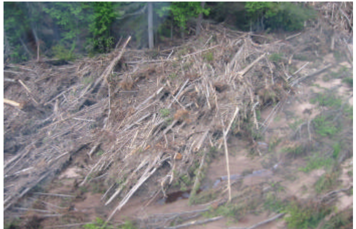
Photo 7. Downed trees and debris below Silver Lake. Source MDNR 6/9/03

Below Silver Lake reservoir and each of the subsequent reservoirs downstream, hundreds of mature trees and shrubs were uprooted or knocked down as a result of the torrent flows (Photo 7). Others, along the stream banks below Silver Lake have sediment several feet thick piled over the roots that will prevent moisture from reaching the roots system and slowly cause the trees to die.