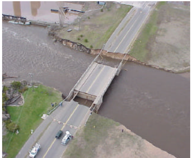
Photo 17. Damaged Lakeshore Blvd. bridge, 5/15/03.

At the end of May 2003, the Marquette County web page, reported that in the City of Marquette, part of Granite Street, Tourist Park, bridges over County Road 550, and the bridge over the Dead River at Lakeshore are closed due to damage. (Photo 11) Further, County Roads AAO and AAT remain close as does Lakeshore Boulevard north of Hawley Street. Marquette County estimated that the cost of repairs to roads and bridges destroyed or damaged at $3 million. Sections of railroad tracts were also damaged causing a disruption in service and operation of the LS&I Railroad.