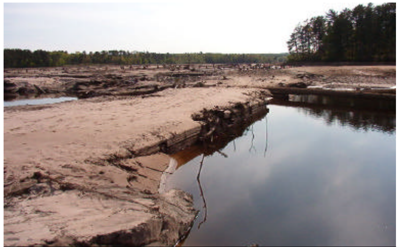
Photo 8. Timber dam near old gun powder factory (not shown) in Tourist Park reservoir.

The EA states that there are no archaeological sites or historic resources in the areas of potential effect for the Dead River or Marquette Projects. However, an old gun powder factory site, from the late 1800's to early 1900's, was discovered in the Tourist Park reservoir. The site consists of bricks and mortar at the ground level. Nearby are the remains of timber dam (Photo 8). The flooding event did not impact the site other than to