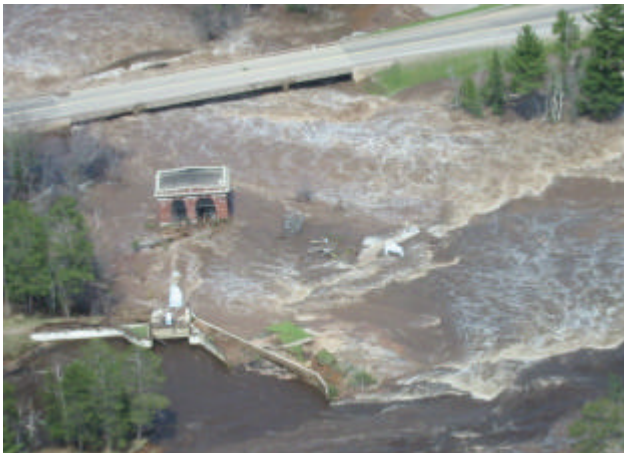
Photo 13. Tourist Park dam breach.