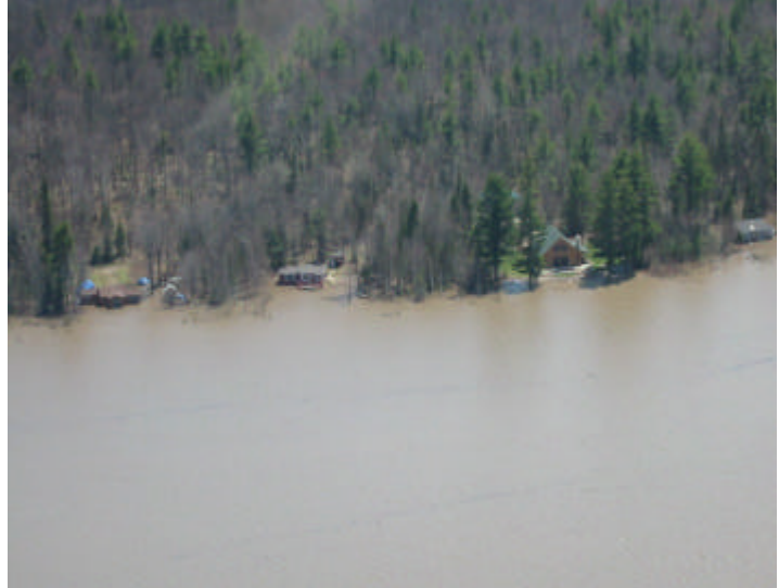
Photo 9. Homes flooded and turbid water in the Dead River Storage Basin. Source MDNR 5/15/03

The Milwaukee Journal Sentinel (May 15, 2003) reported that following the breach of the Silver Lake dike, authorities ordered the evacuation of a 485 acre area in the northern half of Marquette. The report stated that more than 1,800 people were evacuated from their homes on Thursday, May 15, 2003. Marquette County reported that residents were allowed to return to their homes on Friday afternoon. There were no injuries reported and no missing persons associated with the flood. The report also stated that 20 vacation and permanent homes were damaged along with three businesses sustaining structural damage (Photo 9).