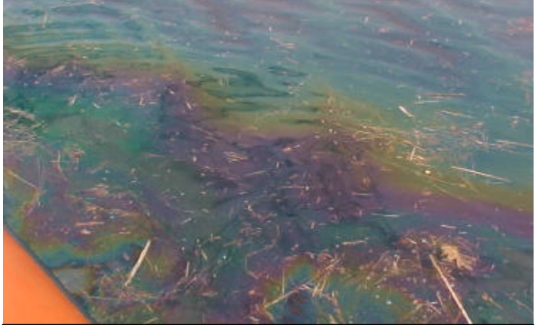
Photo 15. Oily sheen and debris in L. Superior. Source MDNR 5/15/03

Reports of the event (Environmental News Network web page, May 16, 2003) also state that when the Tourist Park dam failed, the flood waters swept through the Presque Isle Power Plant grounds washing coal piles out into Lake Superior. Aerial photographs of the mouth of the Dead River and Lake Superior, taken the day after the breach, show an oily sheen over the surface of the water. (Photo 5)