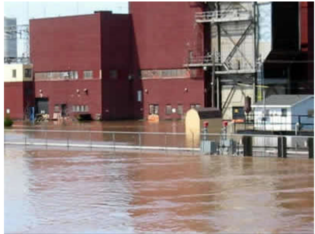
Photo 16. Flooded Presque Isle Power Plant 5/15/03.

The largest economic impact of the flooding event was the shutdown of the Presque Isle Power Plant located at the mouth of Dead River (and immediately below the Tourist Park development). The Marquette Mining Journal (May 29, 2003) reported that the combined waters from Silver Lake and Tourist Park reservoir inundated the plant damaging motors, gearboxes, switching equipment and transformers. The coal-fired plant has nine generating units that produce approximately 635 megawatts of power. Three hundred megawatts of the plants capacity is used to run the Marquette Iron Range mines that employ about 1,500 people. The Marquette Mining Journal (May 30, 2003) reported that shutdown of the power plant and subsequent shutdown of the mines resulted in approximately 1,100 miners being