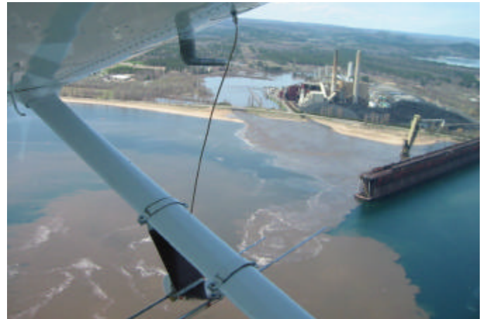
Photo 12. Sediment plume into L. Superior. Presque Isle Power Plant in background. Source MDNR 5/15/03

Review of aerial photographs taken May 23, 2003 show that the sand and gravel sediment from Silver Lake was deposited along the streambanks up to 4.5 miles downstream from the breach (Aero Metrics). The Dead River is approximately 5.4 miles between Silver Lake reservoir and the Dead River storage basin. The difference in elevation between Silver Lake and the Dead River storage basin is approximately 120 feet (a slope of approximately 20 feet per mile) which allowed the larger alluvium and glacial outwash materials to be deposited along the 5.4 mile meandering stream (Photo 4). On May 28, 2003, a site visit to