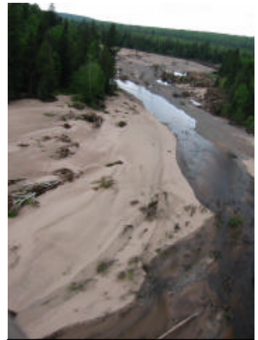
Photo 11. Sediment below Silver Lake.

Further erosion occurred below each of the downstream dams as the river channel exceeded flood stage. Below Hoist, McClure and Forestville, the channel is more deeply incised than the river below Silver Lake. Continuing downstream, the breaching of the Tourist Park dam (Photo 2) resulted in substantial erosion and the release of accumulated sediment from behind the dam. Much of this sediment was deposited in Lake Superior. (Photo 3)